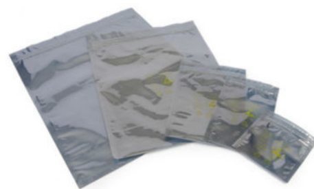
Resealable Loc-Top (LTM)